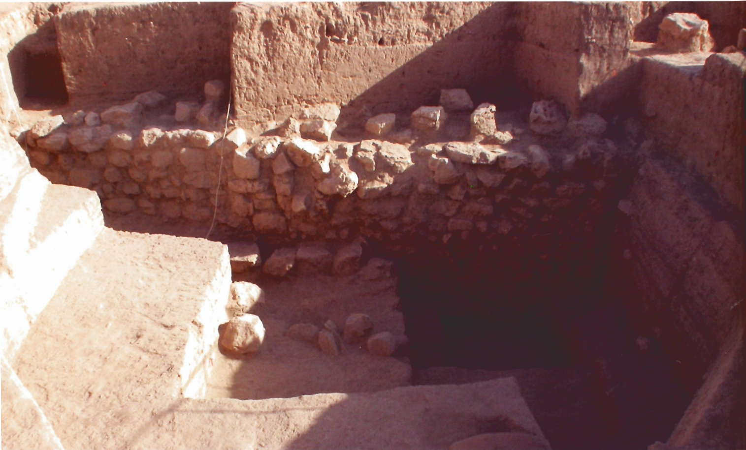
Frontal view of revetment wall, with sounding showing the base of the wall. On the right, in the section, regular accumulations of the last two centuries of use of the Temple Terrace. Previous page: Side view of the monumental staircase (looking NE), with the revetment wall on the left.

Not that seen in the daylight the structure was less spectacular. The full staircase numbers 24 steps, and the trapezoidal shape of the "apron" gives the whole complex an even more imposing appearance. The viewer's attention is directed vertically towards the higher plane where the Temple stands, as if to enhance the awareness of a presence beckoning from above. And the punctuated horizontal rows, with the double effect of wider and narrower vertical risers, emphasize visually the gradual ascent. Also, the broad stone revetment wall that flanks the staircase and apron, serves as a boundary between the two worlds, as if a barrier that can be crossed only at the marked threshold of the staircase.