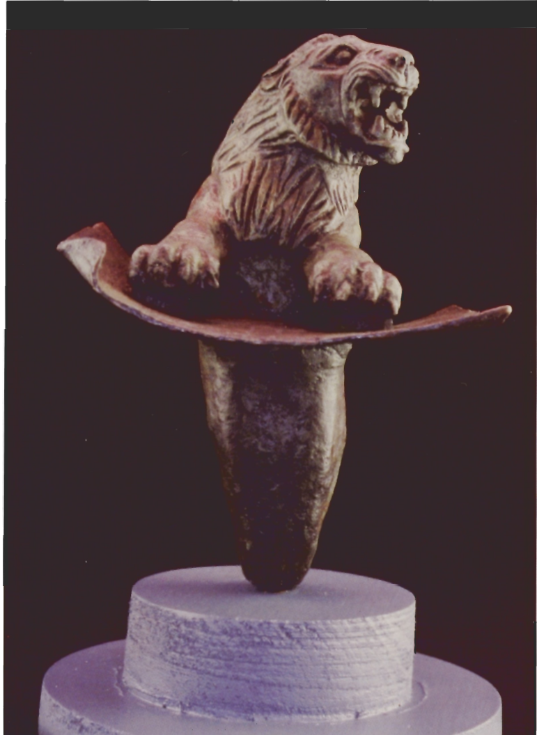
Upper left: One of the very few objects found in the accumulations abutting the revetment wall: a clay snout of a pig or boar. Middle left: stone statue of a lion from our excavations in the Temple on top of the monumental Terrace. Upper right: bronze lion with dedication of the king Tish-atal of Urkesh for the construction of a temple to the god NERGAL (probably a logogram for the Hurrian father of the gods, Kumarbi). The lion was sold on the antiquities market long before our excavations, and was purchased by the Metropolitan. Opposite page: Architect's view (Paola Pesaresi) of the monumental urban complex, with the Palace of Tupkish in the foreground, the Plaza and the Temple Terrace.