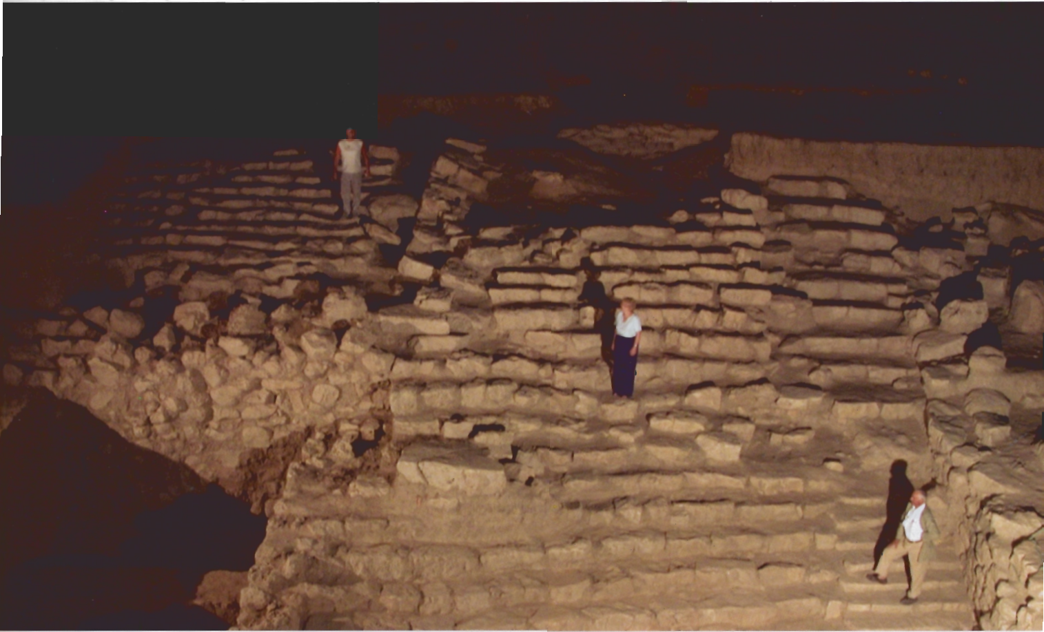
A night view of the monumental staircase, looking towards the Temple. Top of page: reconstruction of the plaza, revetment wall, staircase and temple (drawing Paola Pesaresi).

Here, only the southwestern portion of the Temple Terrace and central portion of the Plaza remained free of buildings . The buildup at the southern edge of the Plaza had a considerable impact on the overall process of site formation.